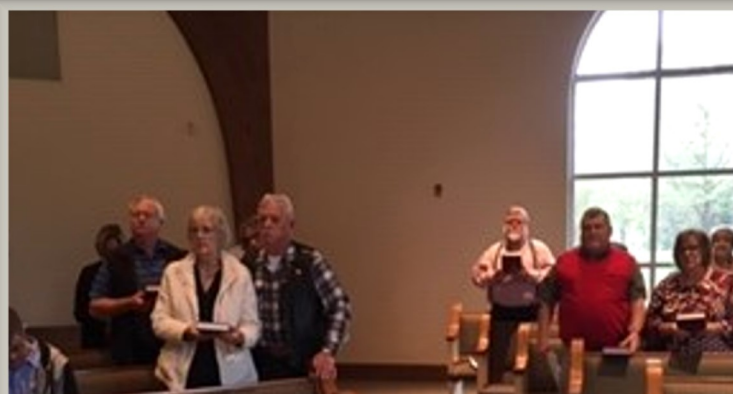
Members of the congregation hold the new hymnals during the prayer of dedication.